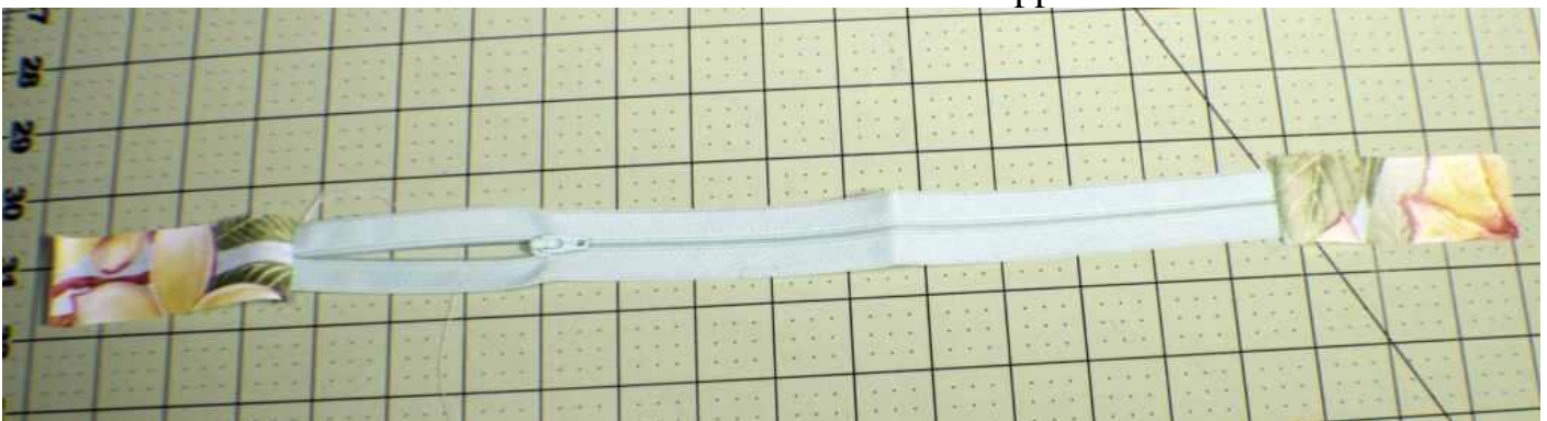
Open out the tabs