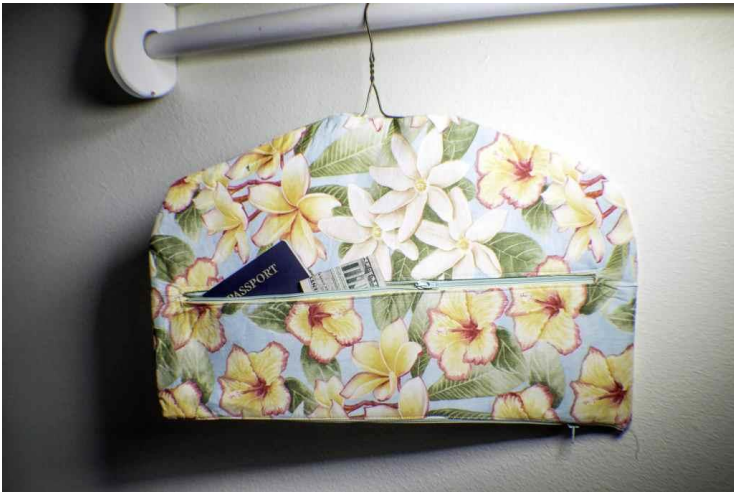
Finished Fabric Close Safe