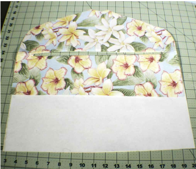
Press the opening

Place the zipper in the center of the hole and either pin or use basting tape. I like to use basting tape. Using a zipper foot sew around the zipper close to the edge of the fabric. The zipper is now installed.