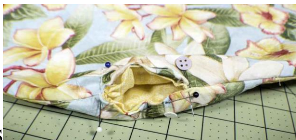
Sew the curved top

Finish the top curve either with bias binding or turn the raw edges under and sew together using ladder stitch. I chose to fold the edges under and sew because the bias binding was a little too fidgety for this project but you could use bias binding if you choose.