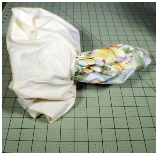
Turn the bag

Turn the safe through the open zipper and the opening in the lining. Push out all of the corners with a chopstick or knitting needle.