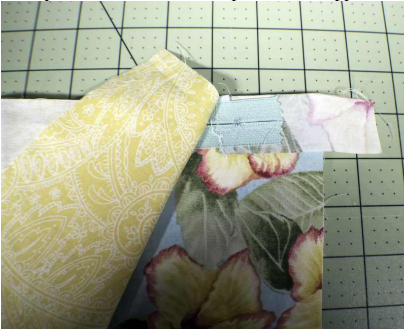
Add the bottom zipper

more professional look and to prevent the zipper from catching on the lining.