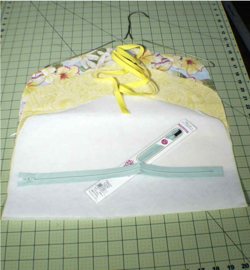
What you will Need Fabric Closet Safe