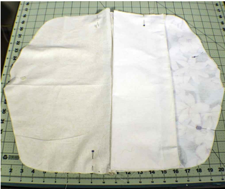
Pin the lining pieces together and the outer pieces together

Unzip the bottom zipper. Pin the lining pieces right sides together and the outer pieces right sides together. Sew all the way around leaving the top curve and an opening in one side of the lining piece for turning. You should have two pieces separated by the bottom zipper.