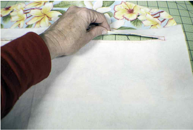
Cut the slit