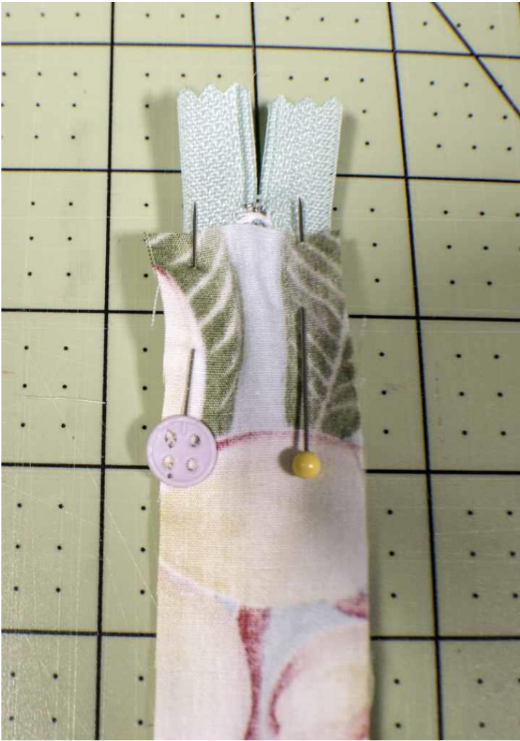
Add the Zipper Tabs